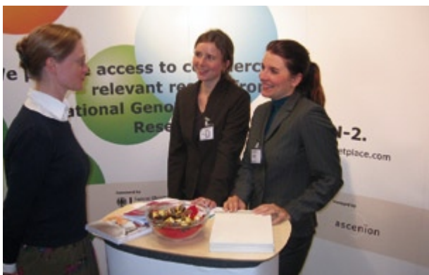
Marketing NGFN-2 inventions